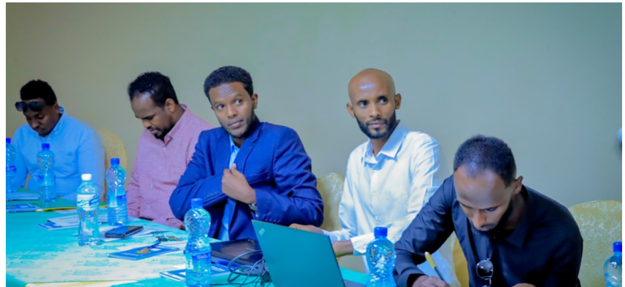
CDG - ANNUAL REPORT 2023

CDG's role in organizing these Public Dialogues extended beyond mere facilitation, aiming to create an environment where community members felt empowered to actively participate in shaping their collective future.