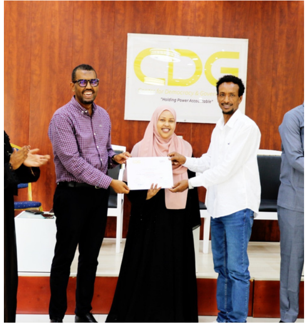
Establishment of Women Political Network In 2023, the Centre for Democracy and Governance (CDG) played a pivotal role in advancing gender equality and supporting women in politics through the Establishment of a Women Political Network. Recognizing the need for a cohesive and supportive platform, CDG took the lead in creating a network that served as a hub for collaboration, support, and advocacy for women involved in politics in Somaliland.

The Training on Campaign Management conducted by CDG provided a targeted and comprehensive curriculum, addressing the unique challenges and opportunities that women face in the political arena. By offering specialized training, CDG sought to enhance the capacities of women involved in politics, enabling them to navigate the complexities of campaign management with confidence. The initiative aimed not only to increase women's representation in political processes but also to create an environment where their perspectives and voices are valued and integrated into decision-making.