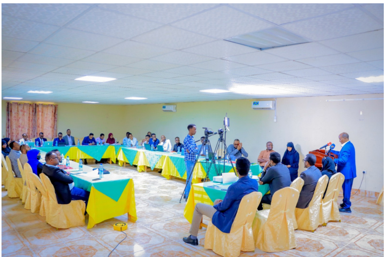
CDG - ANNUAL REPORT 2023